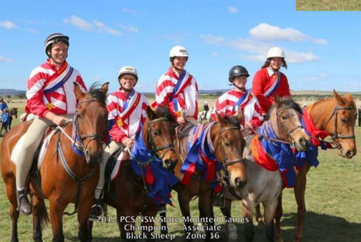
2012 PCS NSW State Mounted Games Champions – Associate Black Sheep – Zone 16