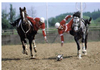
Riders target the "ball" in a horseball game. The ball has leather handles to aid pick up and control.

Horse-ball was introduced to Australia in 2009 off the back of the sport's popularity throughout Europe. Horseball is a game played on horseback where a ball is handled and points are scored by shooting it through a high net.