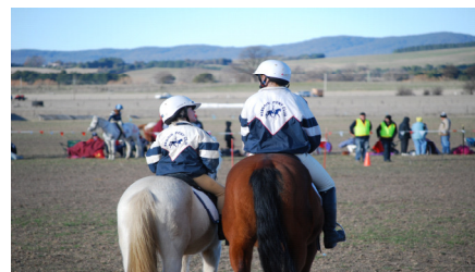
Wamboin riders keep warm in their club jackets.