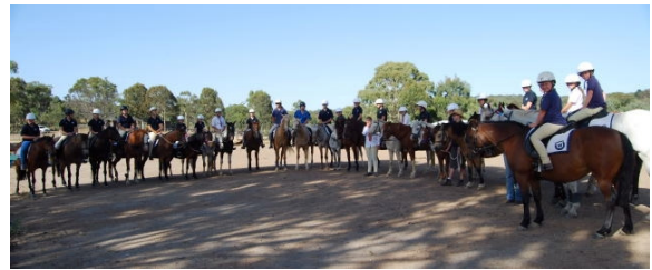
Above: Wamboin Pony Club members at the Feb 09 rally day.